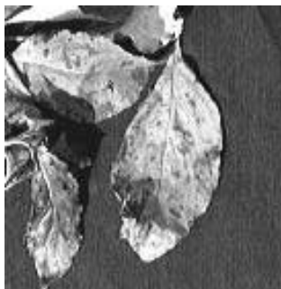
Discula infection of Foliage

Blighted leaves are usually retained on twigs throughout the winter. Twig and branch dieback is most common in the lower part of the tree. As a result of twig blight, succulent epicormic sprouts proliferate on the lower trunk. These tender sprouts are prime candidates for infection the following spring. Infection then progresses into the main stem. Multiple cankers may finally kill the entire tree.