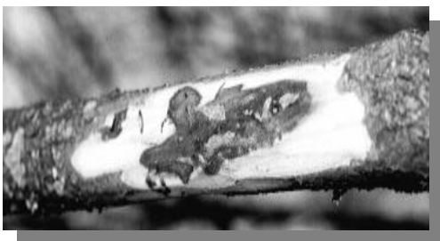
Discula Canker Caused by Shoot Infection