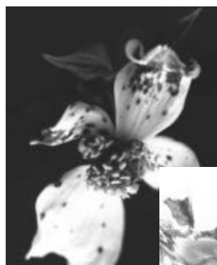
Antracnose on Flowers

Spots on the foliage and flower bracts are small, 1/16 to 1/25 inch in diameter, circular to oval, with reddish-purple borders and a tan centers. Heavily infected foliage and bracts are badly deformed. Infection on shoots and fruit are oval with purple margins. Spot anthracnose tends to be worse on trees in dense crowded conditions.