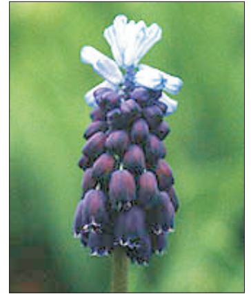
Muscari --Grape hyacinth