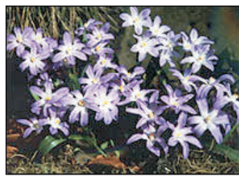
Chionodoxa ---Glory of the Snow

Here's a helpful hint when planting in containers--over plant slightly, with bulbs touching each other, but not the sides of the container. Cover with three to four inches of soil and then mulch. Be sure to water thoroughly.